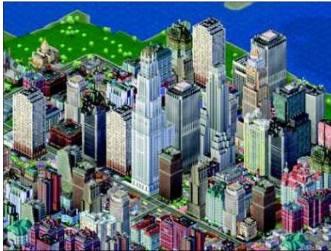
Is SimCity a game?

You play with a toy while you play a game. With a toy there are no predefined goals although during play you tend to set such goals yourself. A number of computer games actually are close to being toys. For example, in SimCity or The Sims there are no clearly defined goals. You can build your own city or family and most likely set your own goals (like creating the biggest city) but there is not really a notion of winning the game. One could add this (e.g. you could add that the game is won when your city has reached a particular population) but this can be frustrating because it is not a natural ending. This being said, there is nothing wrong with creating a nice interactive computer toy.